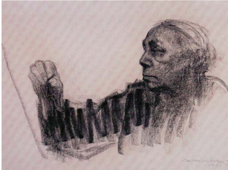
Self-Portrait, Drawing, Kathe Kollowitz © National Gallery of Art